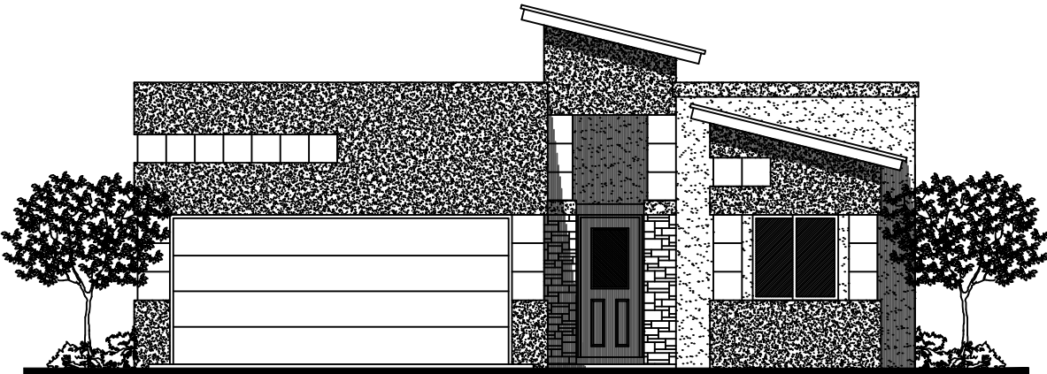
Y - ELEVATION (CONTEMPORARY)