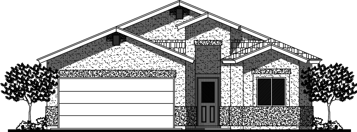
S - ELEVATION (STUCCO)