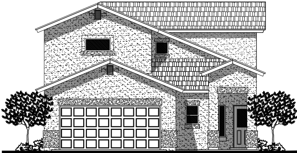
S - ELEVATION (STUCCO)