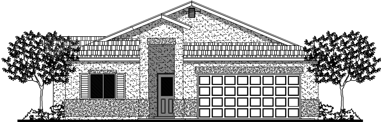
S - ELEVATION (STUCCO)