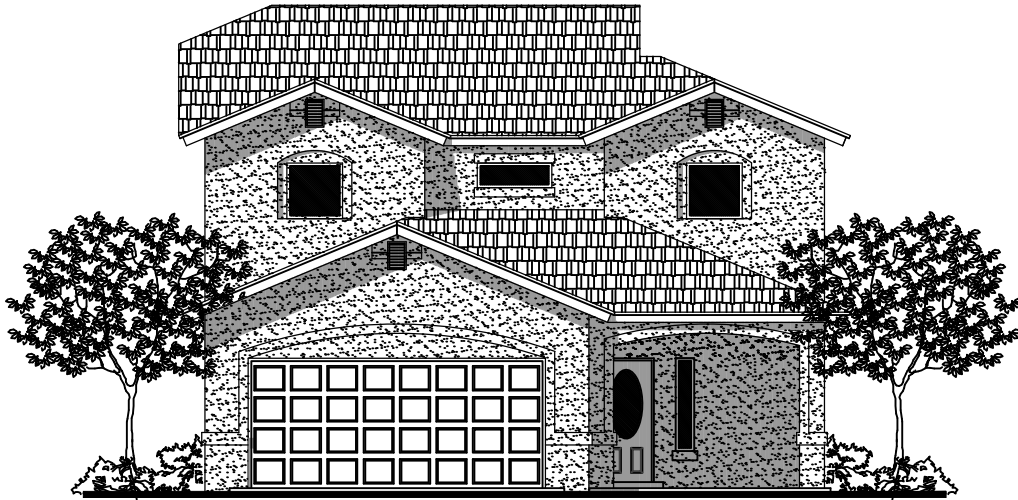
S - ELEVATION