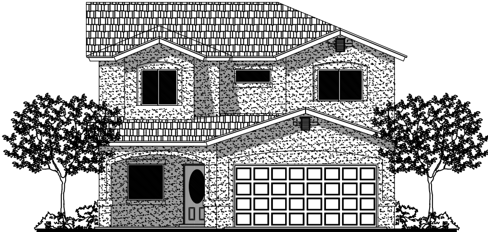
S - ELEVATION