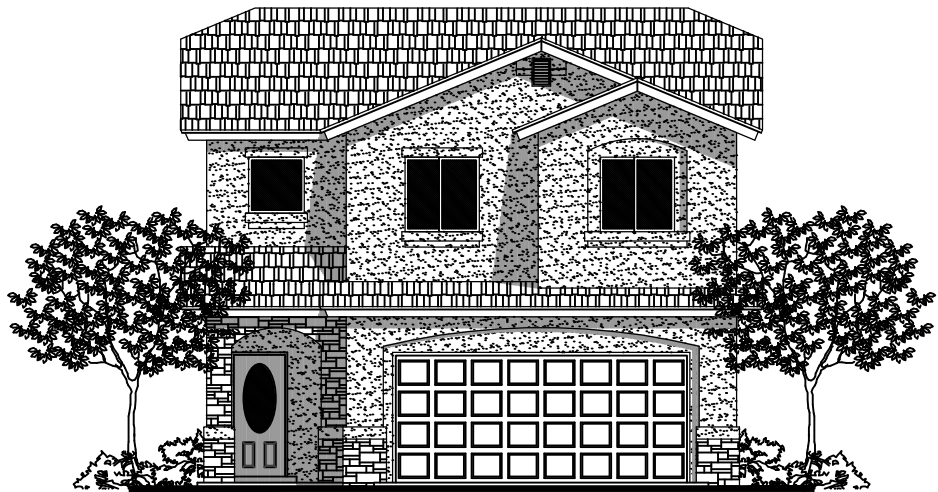
C - ELEVATION (CULTURED STONE)