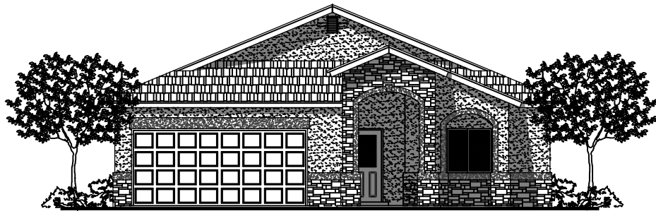
C - ELEVATION (CULTURED STONE)