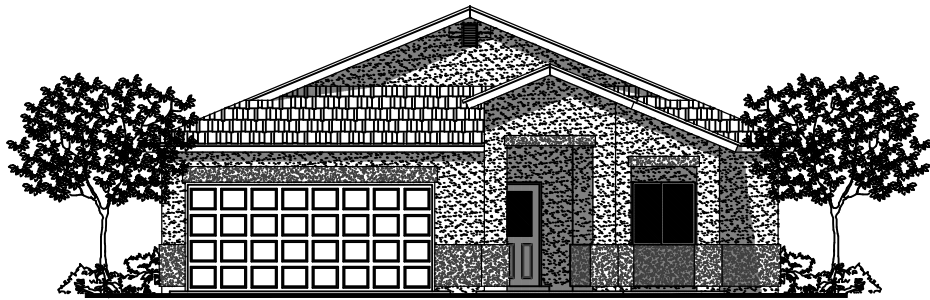
S - ELEVATION (STUCCO)