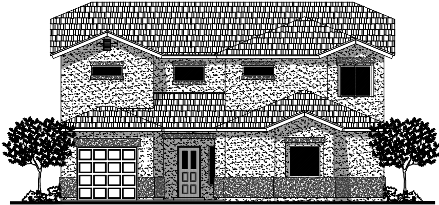
S - ELEVATION (STUCCO)