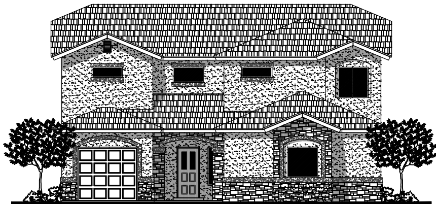
C - ELEVATION (CULTURED STONE)